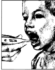
Oral (in the child's mouth)

Although not as accurate, if your child is older than 3 months, you can take his underarm temperature to see if he has a fever. The following is how to take an axillary temperature :