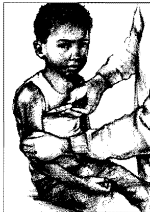
Axillary (under the child's arm)